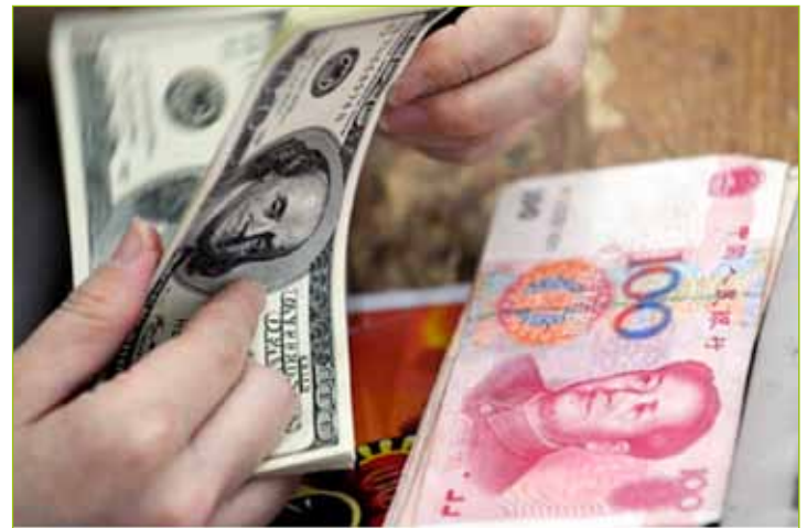
China is reforming its yuan exchange rate

world welcome China's decision to allow more flexibility of the yuan exchange rate.