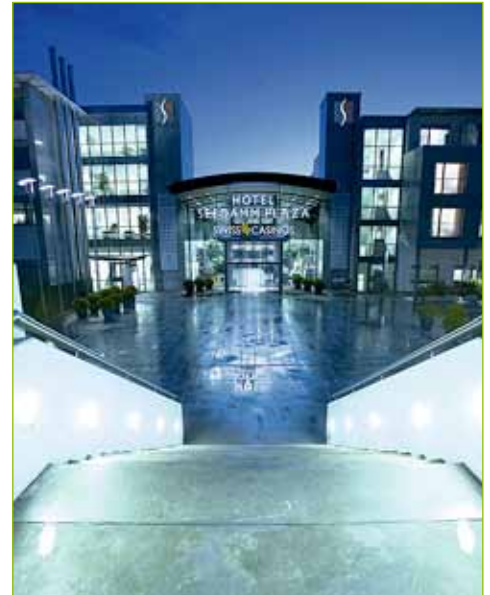
Seedamm Plaza Hotel

Should you have any questions related to the conference,