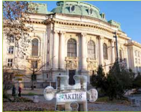
New office of Activ Ltd. in Sofia, Bulgaria

7. Major part of the corporate business of Bulgaria is located in Sofia. From the first 1000 companies in Bulgaria, 455 are based in Sofia. The economic