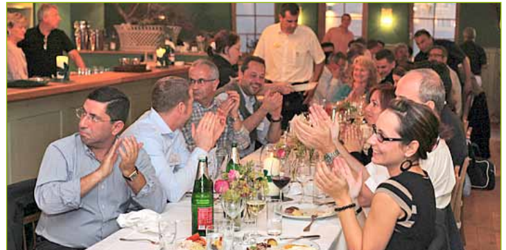
Midsummer night barbecue