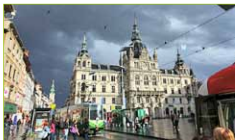
City of Graz

Two stimulating open panel discussion rounds were held