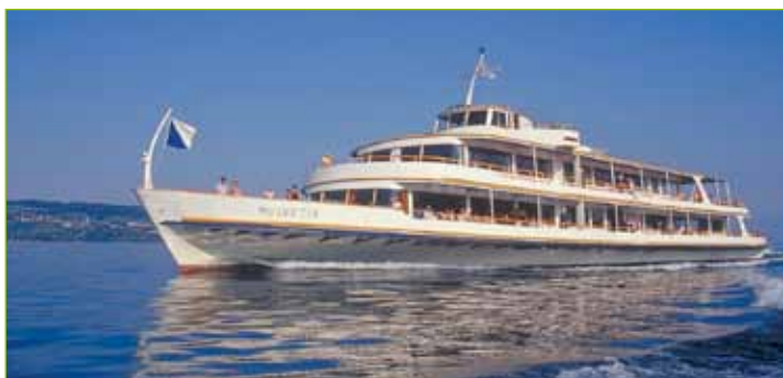
Boat trip on lake Zurich

Additional information about the registration form and the program can be found in the members-only area of the GGI website. Please click here!